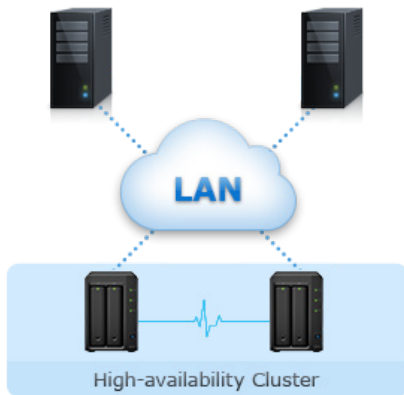
Figure 1) Reliability, Availability & Disaster Recovery

Synology High Availability ensures seamless transition between clustered servers in the event of server failure with minimal impact to businesses.