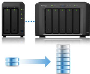
Figure 2) Flexible Scalability

Synology High Availability ensures seamless transition between clustered servers in the event of server failure with minimal impact to businesses.